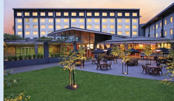
Novotel - Hotel & garden bar

41 Bridge Road, Glebe NSW 2037 Phone NZ 0800 451 590 | AUS 1300 789 845 | Fax +61 2 9660 9786 www.interpoint.com.au